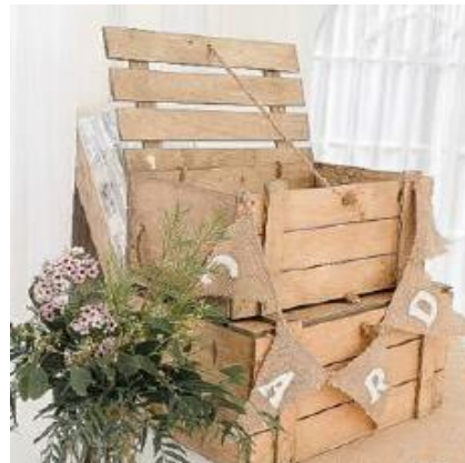
WOODEN WISHING WELL CRATES $75