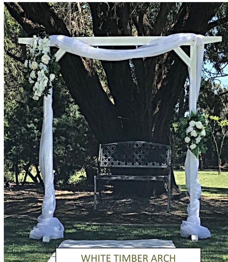
WHITE TIMBER ARCH