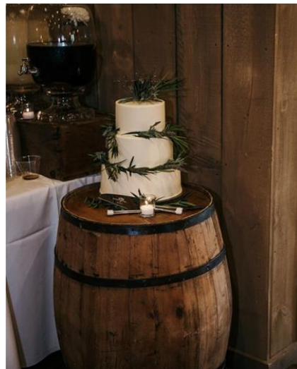
WINEBARREL CAKE TABLE $150

Decorating items and lawn games will still be charged if it happens to rain on the day of your wedding. Unfortunately the weather is out of our hands and we make the decision ½ hour beforehand if we are doing a wet weather ceremony under the deck. You have the option on the morning of the wedding to make the decision if you want to go with the wet weather back up and we can set up your ceremony decorations on the deck, otherwise any arches and tree draping will be set up at your ceremony area and hopefully you will get some beautiful photos later on if the rain subsides.