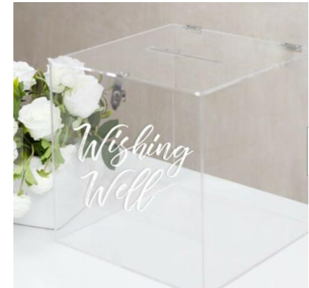
CLEAR WISHING WELL $75