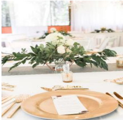
GOLD CUTLERY $5 PER SET GOLD CHARGER PLATE $5 EACH